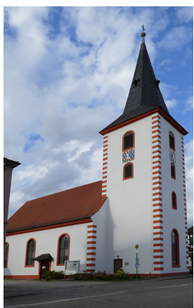
church in Diersheim built 1731