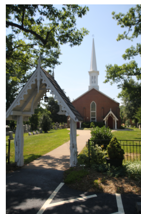
Greenwich Church Built 1858